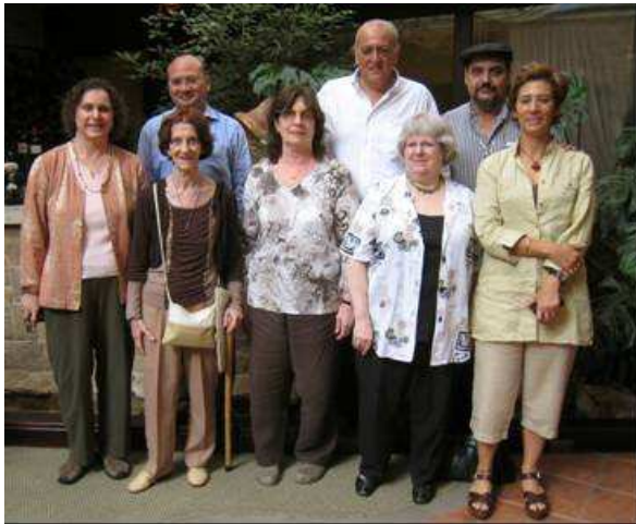
Costa Rica IFLA Americas CLC Group Meeting November 28, 2007.