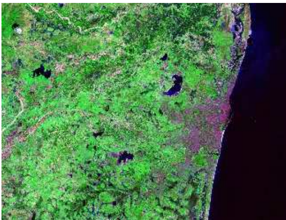
Chennai is on the south-east coast of India on the Eastern Coastal Plains.