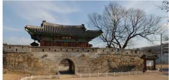
Part of the culturally and historically important Deokjinjin Garrison, Ganghwa County, Republic of Korea. Retrieved 28 April 2008 at http://www.unesco-paysage.umontreal.ca/activites-pedagogiques.html

Syria (Faculty of Architecture of Damascus). A partnership with the Town of Ganghwa has been opened in the Republic of Korea, which hosted the Workshop_atelier/terrain (WAT) of the CUPEUM in November 2007, while one planned for October 2008 is already in preparation with Tonggi University in Shanghai.